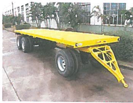
Semitrailer (part of the weight rests on the pulling unit) Full-trailer (weight does not rest on the pulling unit)